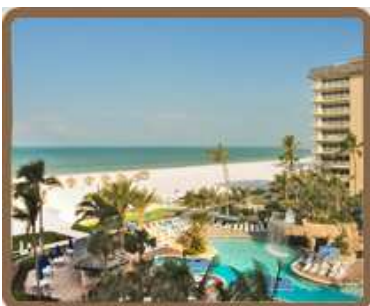
Marco Island Marriott