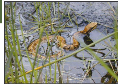
Juvenile Cottonmouth

The program consists of 4 'fact sheets' as well as PowerPoint presentation. The fact sheets are available on IFAS EDIS system. The PowerPoint is available upon request. The four publications are 1) Dealing with Venomous Snakes in Florida School Yards, 2) Emergency Snakebite Action Plan, 3) Preventing Encounters Between Children and Snakes", 4) Recognizing Florida's Venomous Snakes".